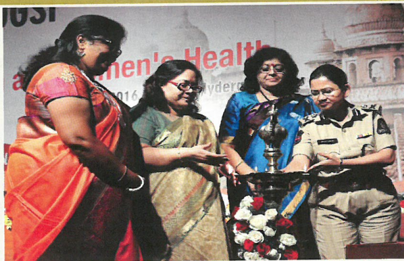
The Chairperson (2nd from left) with others at the inaugural ceremony.

Speaking on the occasion, NCW Chairperson Lalitha Kumaramangalam said that as about 30% women face violence, gynaecologists should develop a women and victim-friendly approach and work in tandem with the police to prevent such violence. The inaugural session was followed by a well-attended, public forum and cyclathon in which 300 men, women, boys and girls actively participated raising slogans and holding placards. Colleges, IT sector, the media and NGOs working for the welfare of women took part in this initiative.