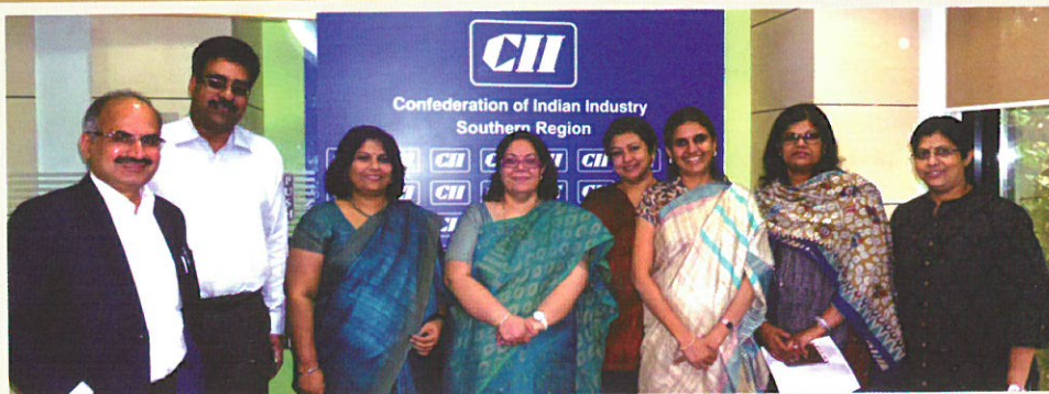
NCW Chairperson (4th from left) with other participants.