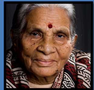
Smt. Krishnammal Jagannathan is a Gandhian Activist for Social Injustice from the Indian state of Tamil Nadu and awarded the Padma Bhushan for her contribution in the field of Social Work.