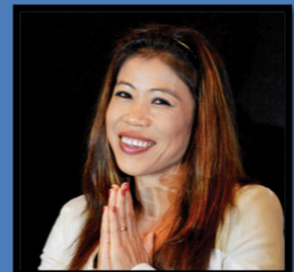
Mante Chungneijang Mary Kom is an Indian Olympic Boxer and incumbent Member of Parliament, Rajya Sabha from the state of Manipur and conferred with Padma Vibhushan this year.