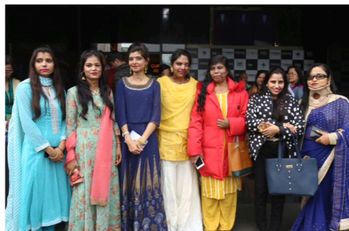
Glimpses from the Chhapaak Film Screening Event.