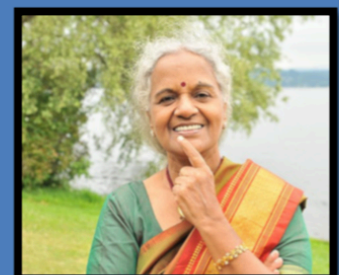
Dr. Padmavathy Bandopadhyay is a Padma Shri Awardee and Aviation Medicine Specialist. She was awarded the Vishisht Seva Medal for her conduct during the Indo-Pakistan War of 1971.